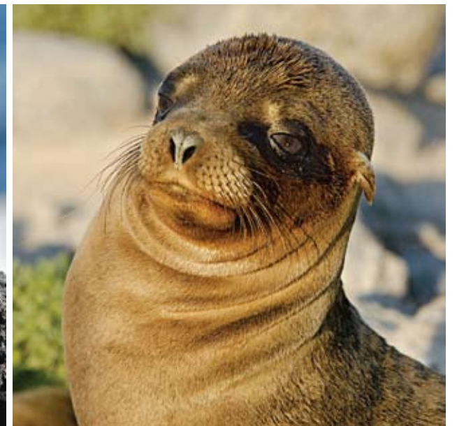
ANIMAL PLANET. The wildlife was not intimidated by us including (clockwise from top left), an iguana, Sally Lightfoot crab, sea lion and marine iguana.

Soon after sunrise each morning, we were off exploring our new location, which was guaranteed to be different from our previous one. The diversity of the topography and wildlife was stunning, and while sometimes we felt like taking a break from the intense schedule, it was impossible not to want to see everything.