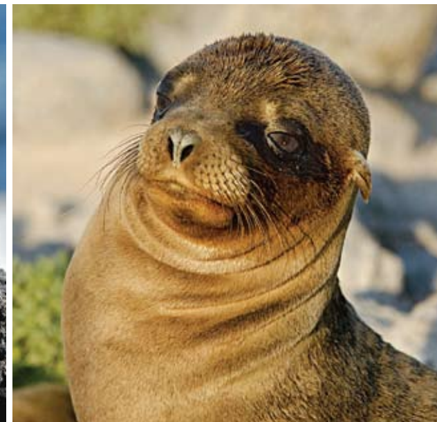
ANIMAL PLANET. The wildlife was not intimidated by us including (clockwise from top left), an iguana, Sally Lightfoot crab, sea lion and marine iguana.

Soon after sunrise each morning, we were off exploring our new location, which was guaranteed to be different from our previous one. The diversity of the topography and wildlife was stunning, and while sometimes we felt like taking a break from the intense schedule, it was impossible not to want to see everything.