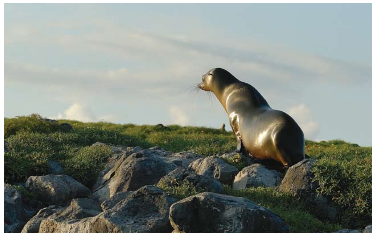
ILLUSTRATION BY BRENDA WEAVER

Before reaching Darwin's world, we planned to visit the lost world of Isla del Coco, a large island halfway between