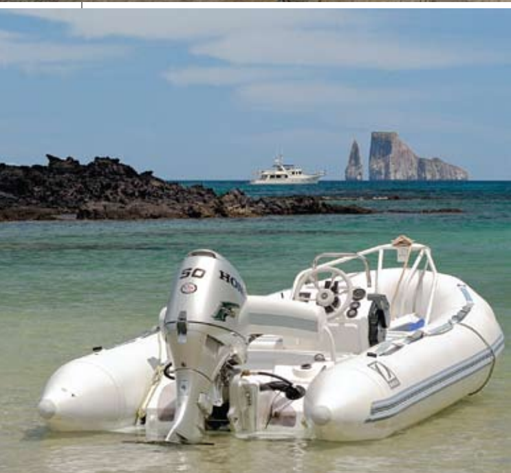
LAND OF CONTRASTS. Each day saw different landscapes, from black lava flows (above) to white sandy beaches to rock formations on San Cristobal (opening spread). Venture's tender awaits her crew (left).

join renowned boatbuilder and intrepid cruiser Tony Fleming aboard his personal Fleming 65, Venture , for a voyage to the Galápagos Islands, located 525 miles off the coast of Ecuador.