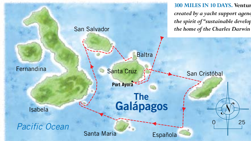
300 MILES IN 10 DAYS. Venture's ambitious itinerary covering seven islands was created by a yacht support agency and approved by the Ecuadorian government. In the spirit of "sustainable development," it had to be followed precisely. Port Ayora is the home of the Charles Darwin Research Station and National Park Service.

Because of the distance involved when cruising to the