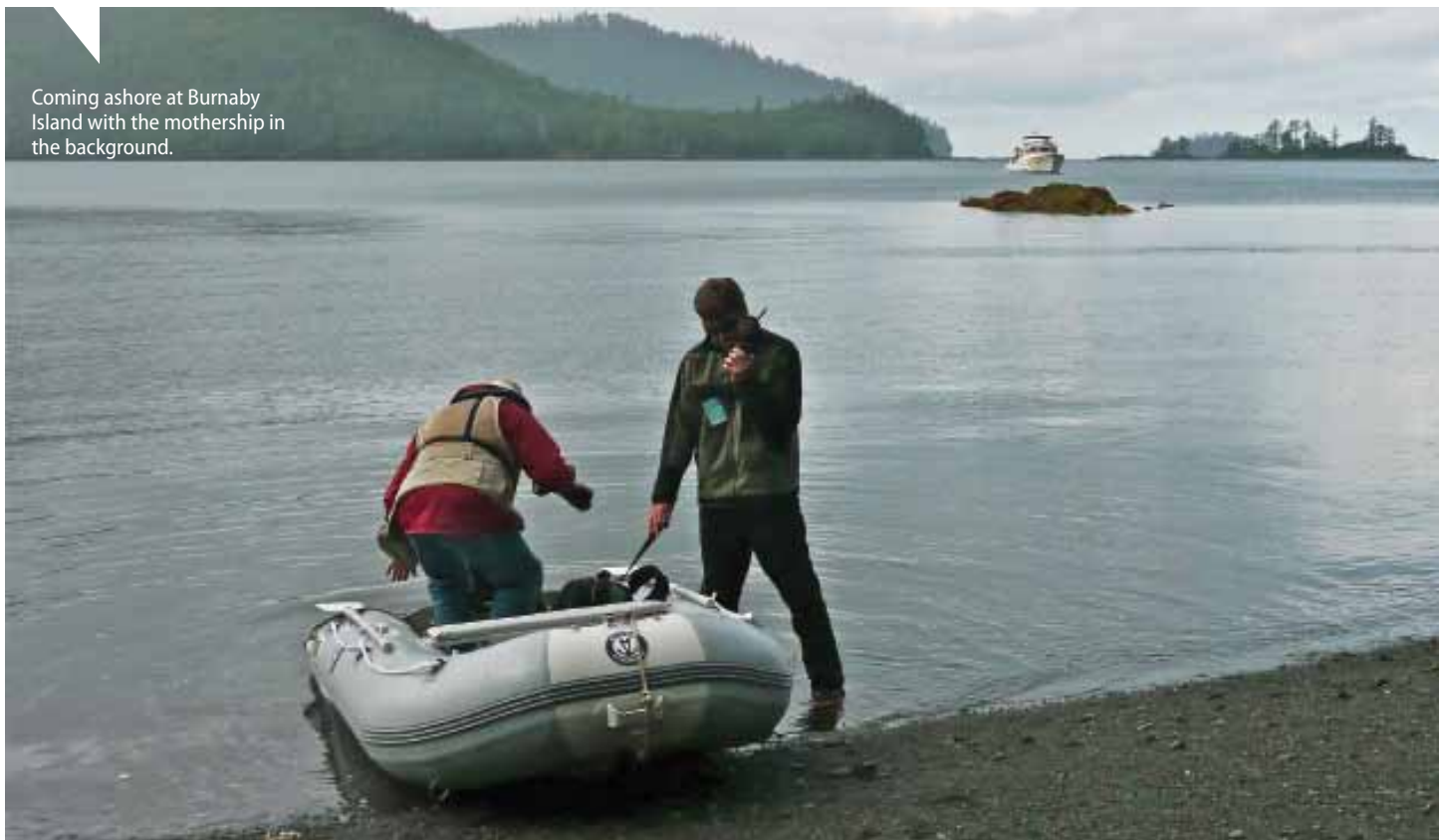
Coming ashore at Burnaby Island with the mothership in the background.