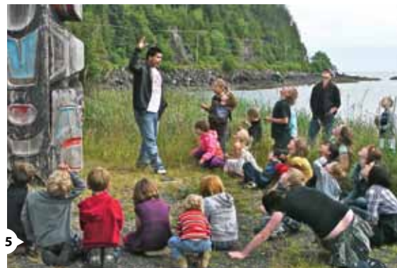
[ 4 ] Because of the damp climate, moss covers nearly everything eventually. [ 5 ] Taking part in the mandatory Haida Gwaii orientation at the museum.

of sight with the few and widely spaced watchman sites. We did not have a working satellite phone on board, which turned out to be a mistake. Anyone visiting this area would be strongly advised to carry a satellite phone.