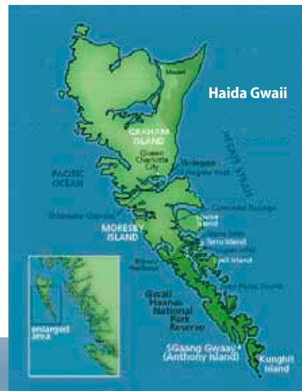
Making the final approach to Haida Gwaii after 29 hours underway.

Moresby, the southern of the two main islands, is almost uninhabited with the bulk of it taken up with the Gwaii Haanas national park. A visit to Gwaii Haanas requires prior attendance at an orientation course held at the museum. We had