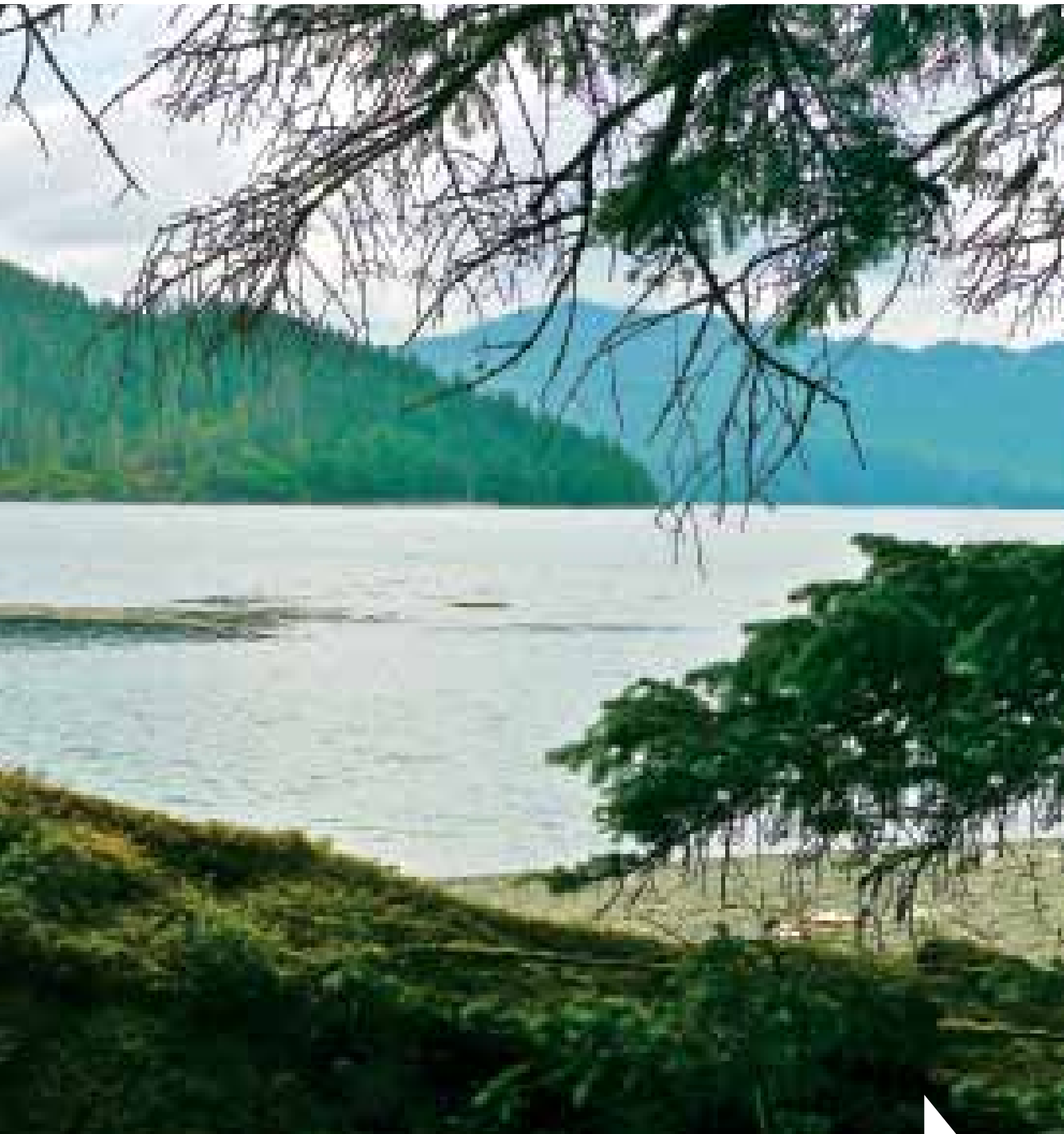
Venture at anchor off of Tanu in the Moresby Archipelago.