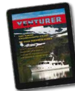
Every new Fleming now comes with an Apple iPad "eFIT" (Fleming Information Tablet) preloaded with an owner's manual, schematics, parts lists, Navionics charts, VENTURER magazine and more.

It's a fact that around half of our customers used to own sailing yachts, indeed many are still keenly involved in sailing activities of all kinds. But now they also possess what many boating journalists & Fleming Owners around the world believe to be the ultimate cruising motor yacht. If you've ever considered it might be time for a change, visit us at www.flemingyachts.com and see how we can help you enjoy the best of both worlds.