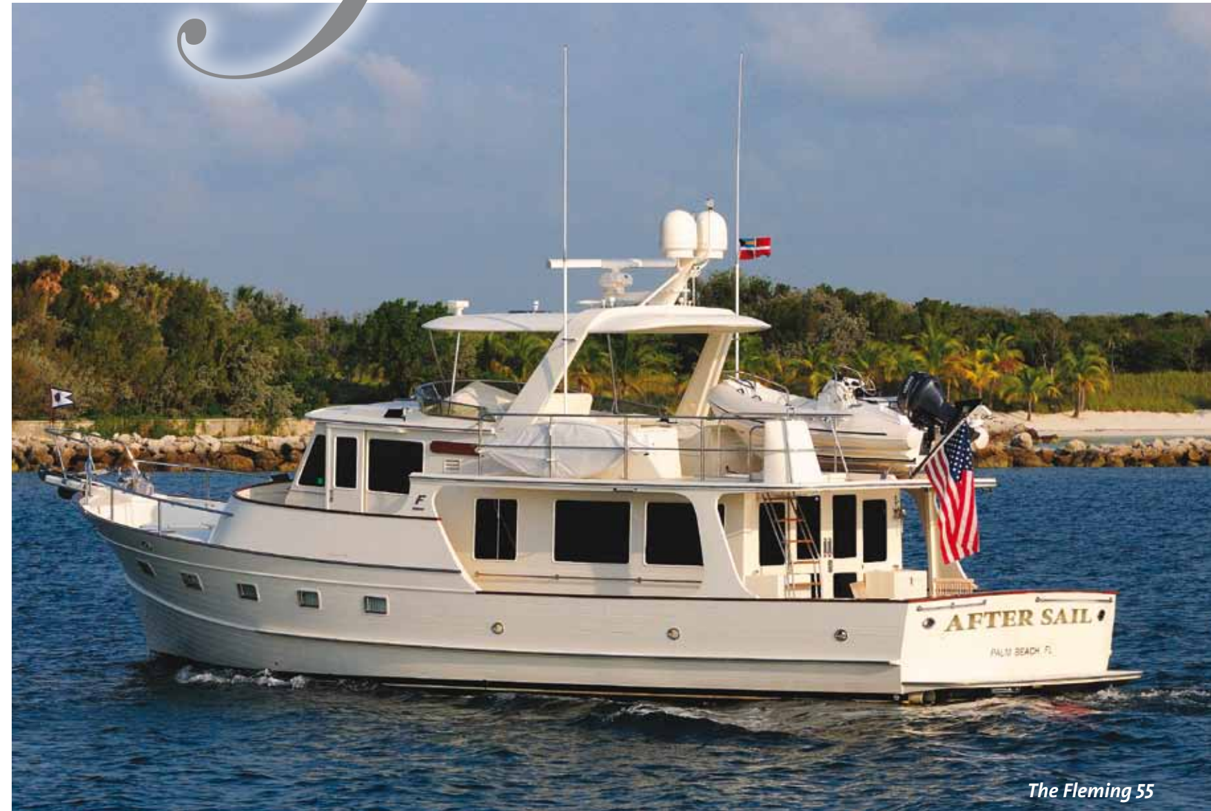
The Fleming 55