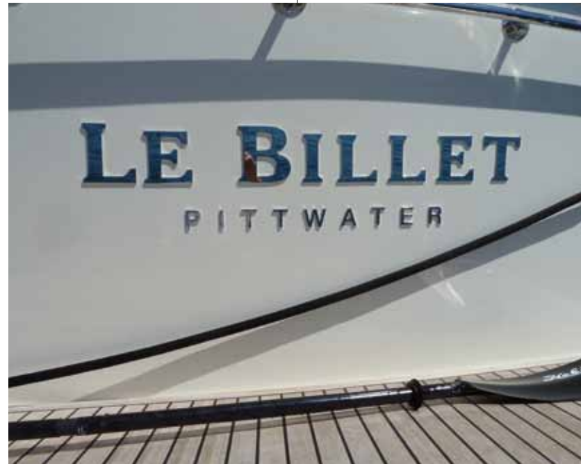
MOTOR MAN Le Billet – Bill's Fleming 55 had enough features to feed his salt-water addiction in a different style.

20 to 30 knots; so the slower, more traditional trawler motor yacht appears to be their style. Although Bill's Fleming 55 is fitted with twin-engines, these days many trawler (or passage maker) motor yachts come equipped with just one engine (and a back-up auxiliary) for long-range cruising efficiency. So for yachties the transition to a cruising motor yacht is not too hard as they are used to close quarters maneuvering with only the one engine of a sailing yacht. This gives sailing skippers the docking skills that most motor yachtsmen used to driving a boat